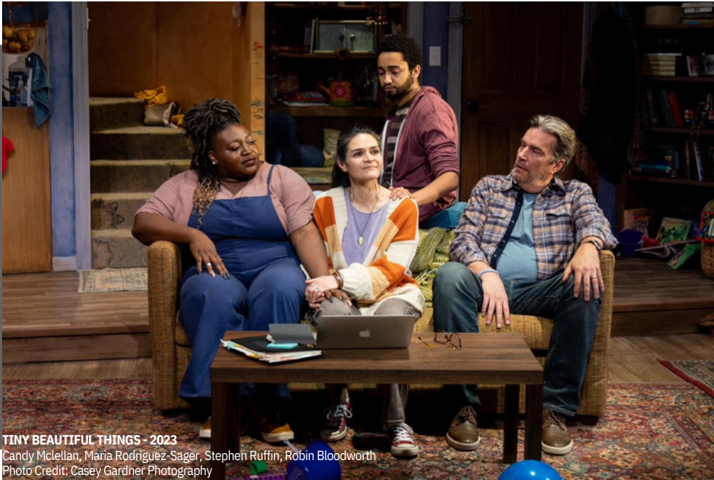
TINY BEAUTIFUL THINGS - 2023

Mailing address: P.O. Box 1555, Atlanta, GA 30301