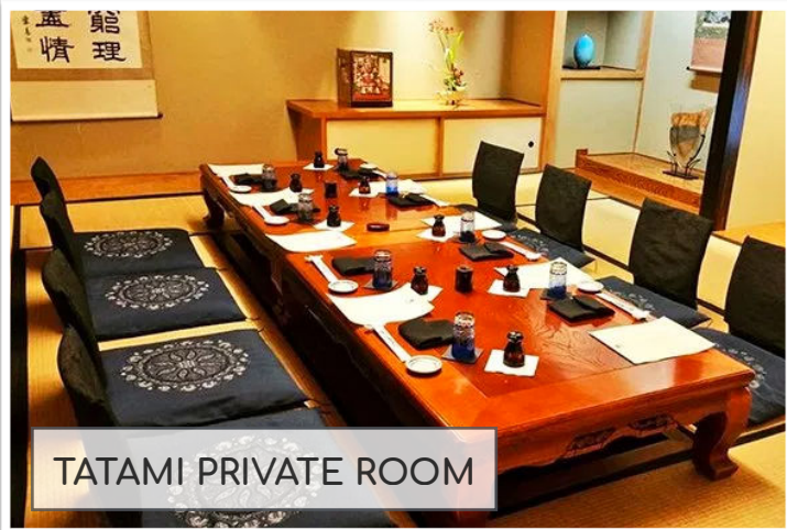
TATAMI PRIVATE ROOM

teppanyaki • traditional dining • sushi bar • tatami room